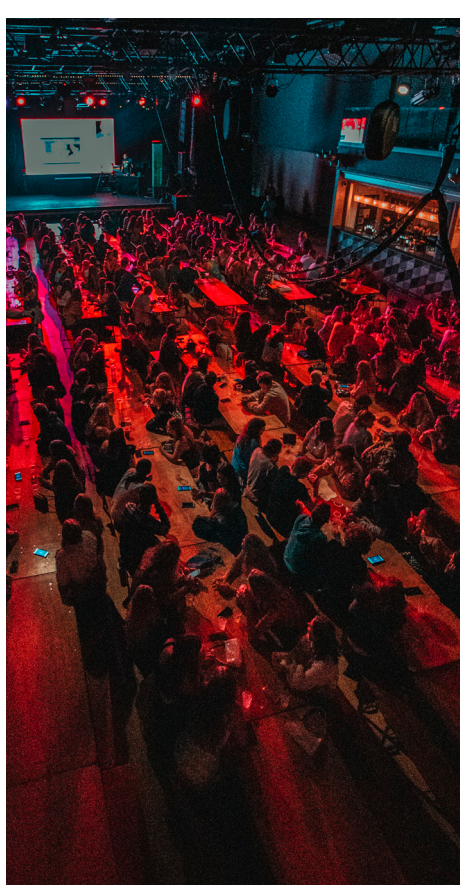
Big Pub Quiz |